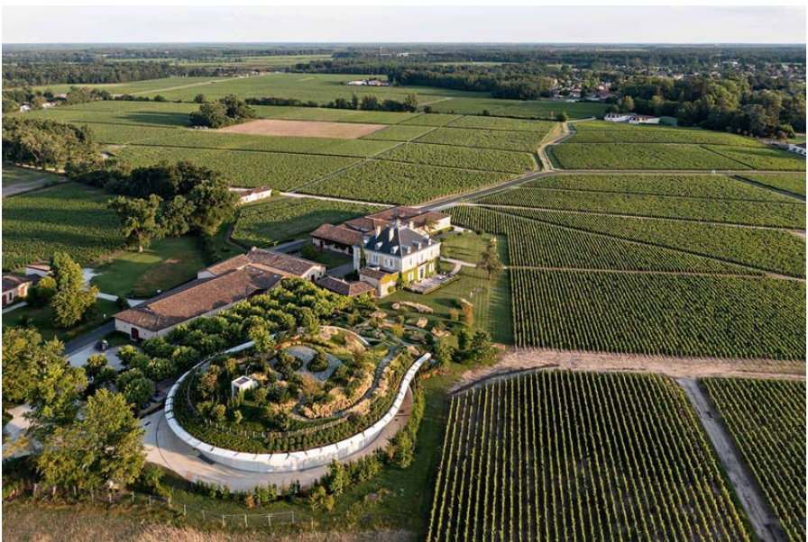
Château Haut-Bailly aerial view