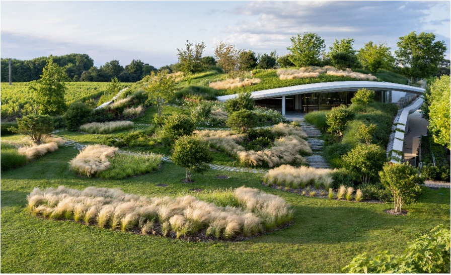
Château Haut-Bailly winemaking facility and cellar